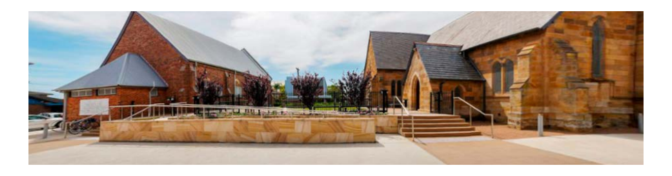
St Michael's Anglican Cathedral, Wollongong

For more information and specific requirements on accessible toilets, parking, building restrictions etc, see Appendix 1: The Disability Discrimination Act (DDA) and the Building Code of Australia (BCA) .